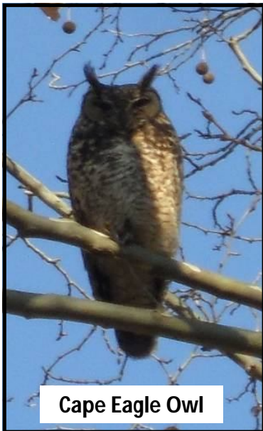
Cape Eagle Owl